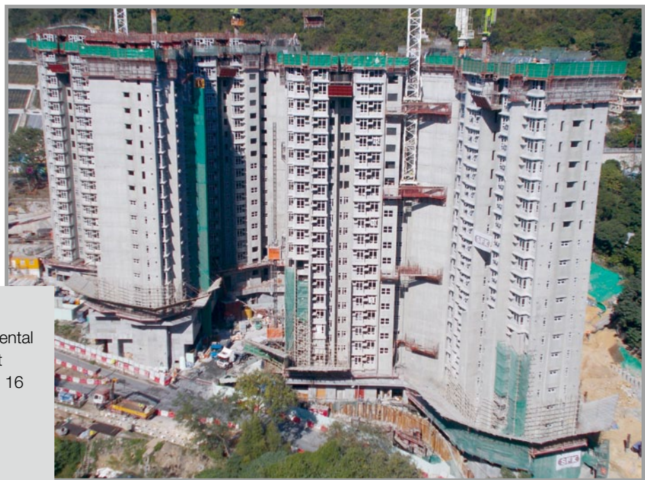
Construction of Public Rental Housing Development at Fo Tan (in Sha Tin Areas 16 & 58D) Phase 1 & 2