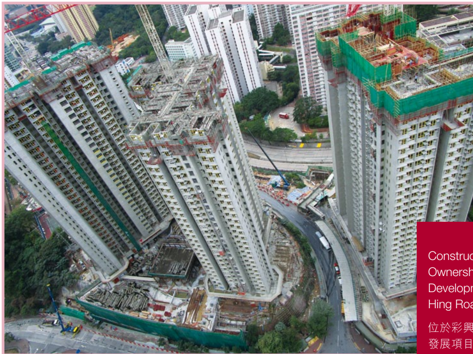
Construction of Home Ownership Scheme Development at Choi Hing Road