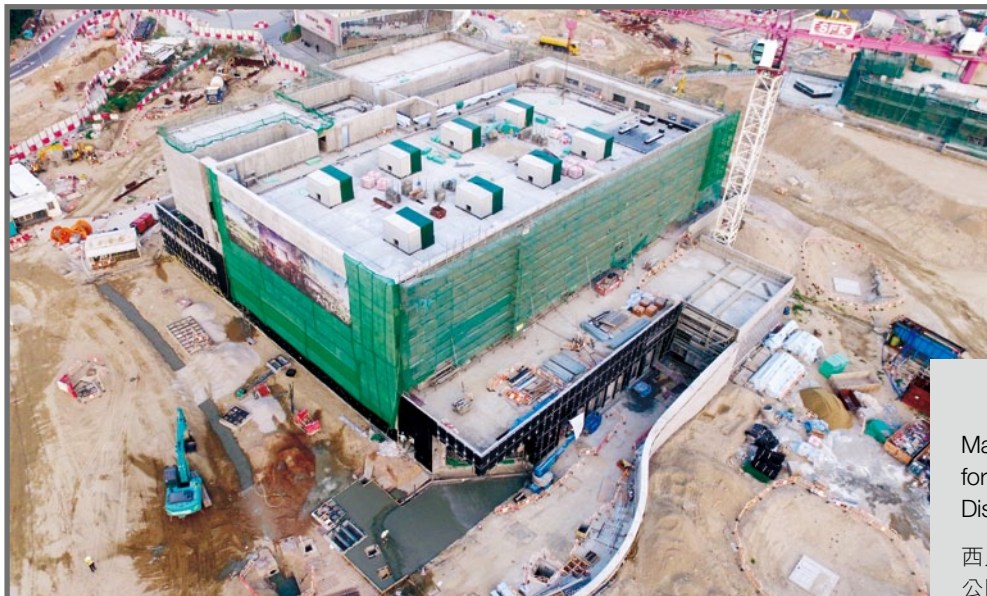
Main Contract for The Park for West Kowloon Cultural District Authority