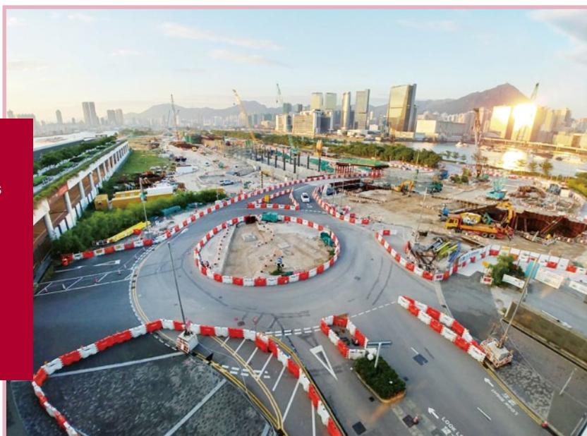
Kai Tak Development — Stage 2 Infrastructure Works for Development at the Southern Part of the Former Runway