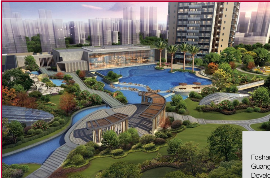
Foshan Sun Fook Kong Guang Chang Development, Foshan 佛山新福港廣場項目