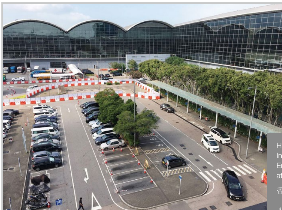
Hong Kong International Airport — Enhancement Work at Car Park 1